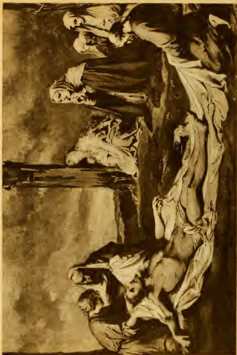
“He wrapped Him up in fine linen.